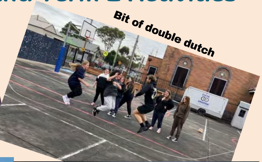
Bit of double dutch