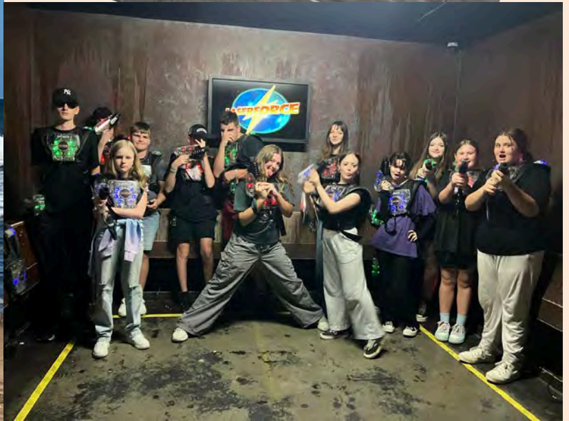
Game On - Holiday activity fun