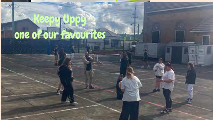
Keepy Uppy one of our favourites