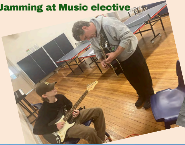
Jamming at Music elective